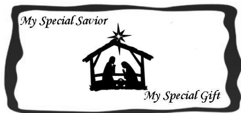
My Special Savior, My Special Gift

As we prepare for Jesus to be born, we contemplate the gifts that he gives freely to us. We can never repay Jesus for these gifts. Yet, we can show thanks and praise to him by what and how we give. As we think about those blessings this Christmas-time, please take a moment to prayerfully consider giving a special offering of thanks to the Lord for his great Christmas gift.